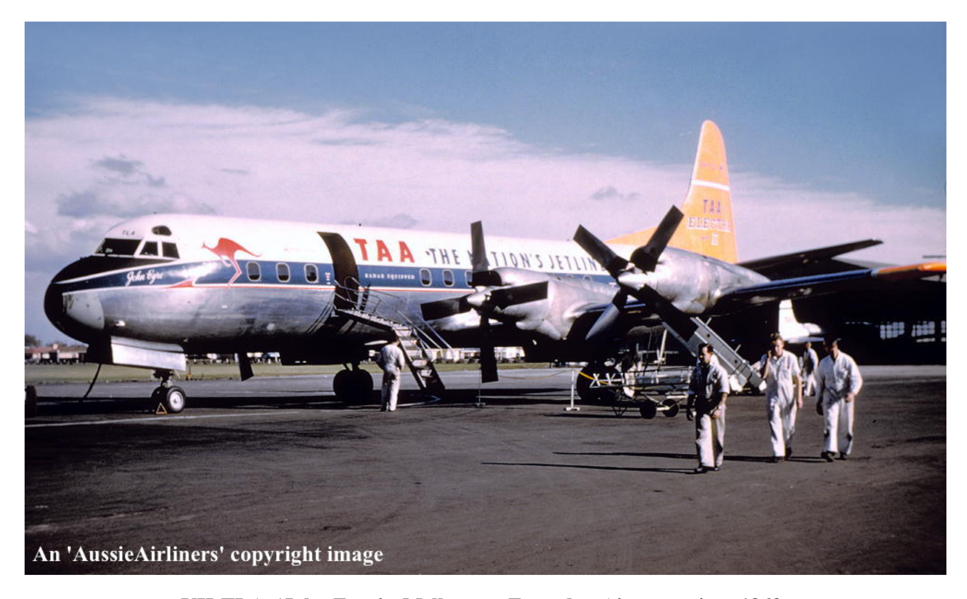
VH-TLA. 'John Eyre' - Melbourne Essendon Airport - circa 1962.