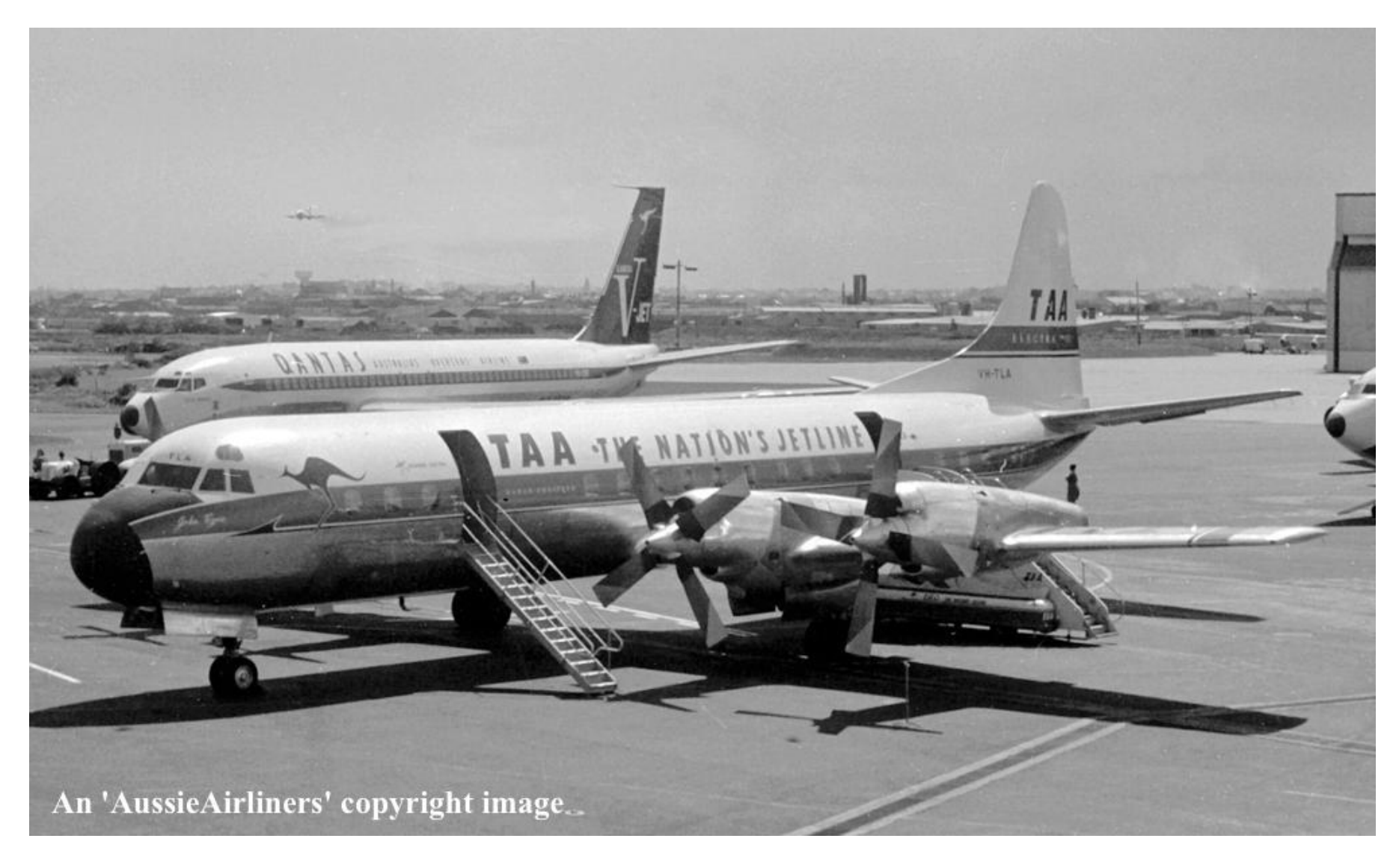
VH-TLA. 'John Eyre' - Sydney Kingsford Smith Airport - date unknown.