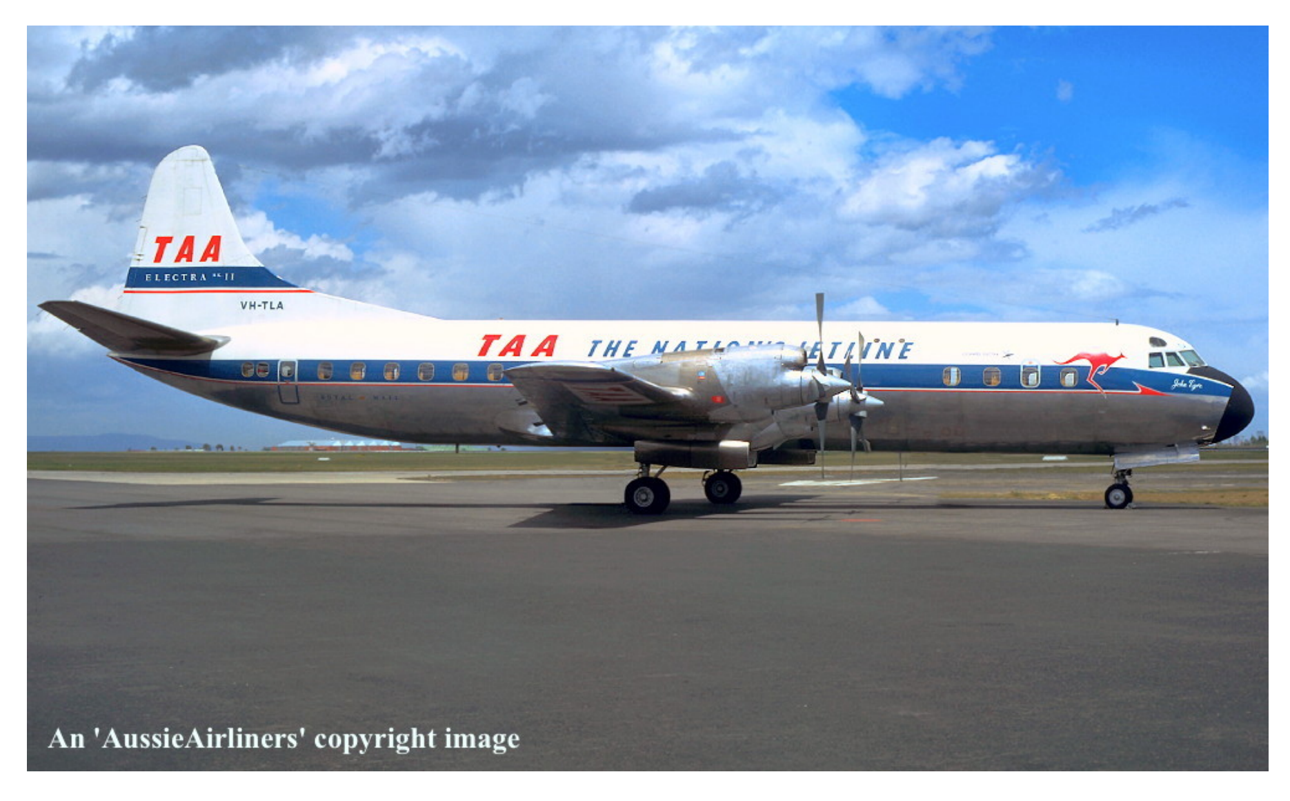
VH-TLA. 'John Eyre' - Melbourne Essendon Airport - January 17, 1968.