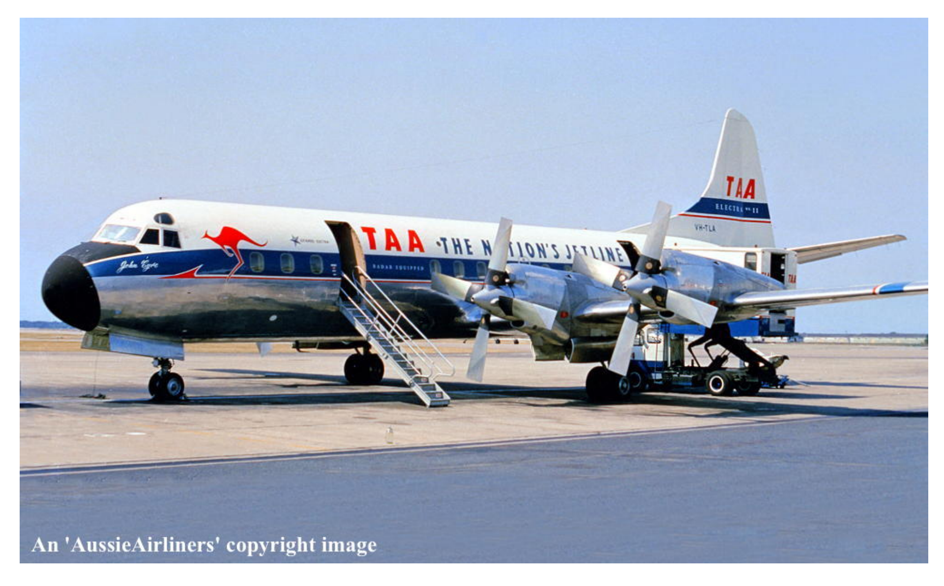
VH-TLA. 'John Eyre' - Brisbane Archerfield Airport - date unknown.