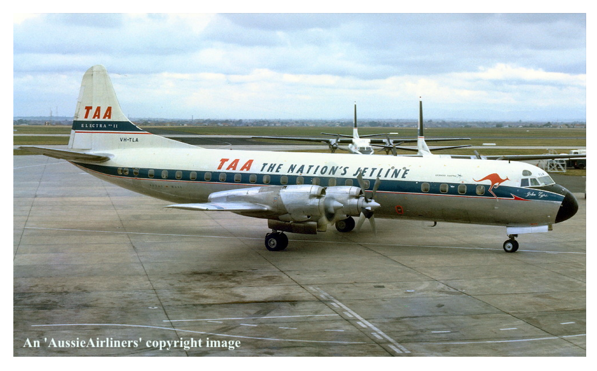
VH-TLA. 'John Eyre' - Melbourne Essendon Airport - June 1967.