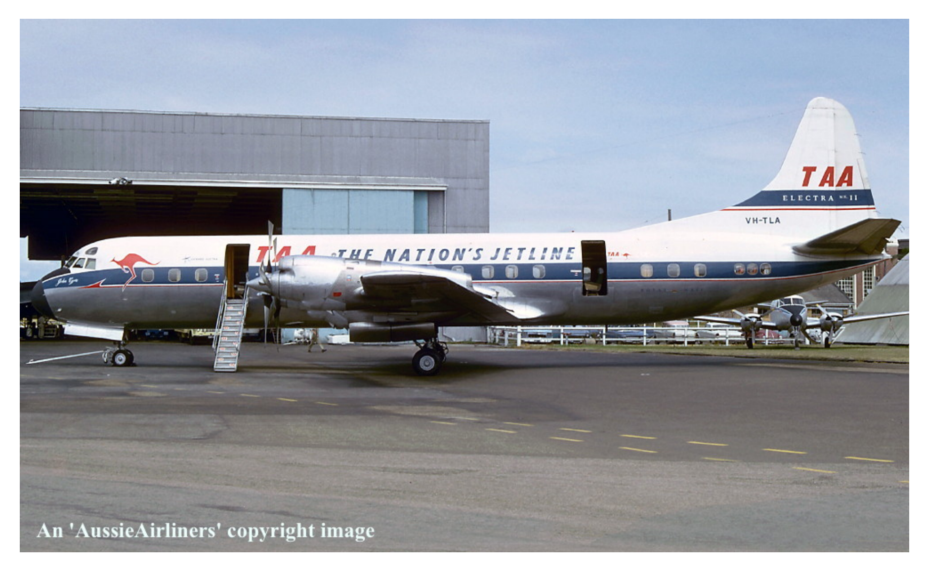
VH-TLA. 'John Eyre' - Brisbane Archerfield Airport - February 1967.