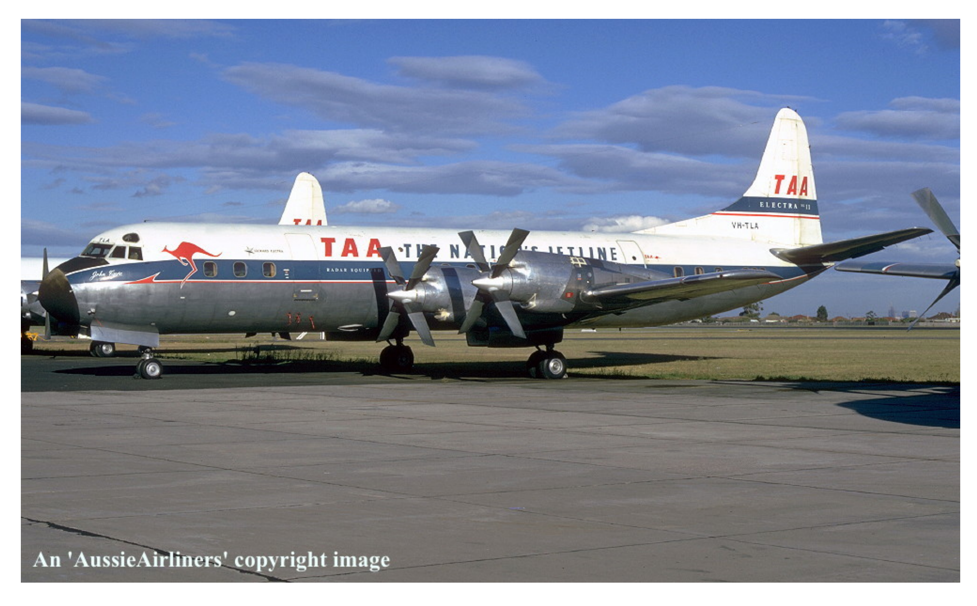
VH-TLA. 'John Eyre' - Melbourne Essendon Airport - February 1972.