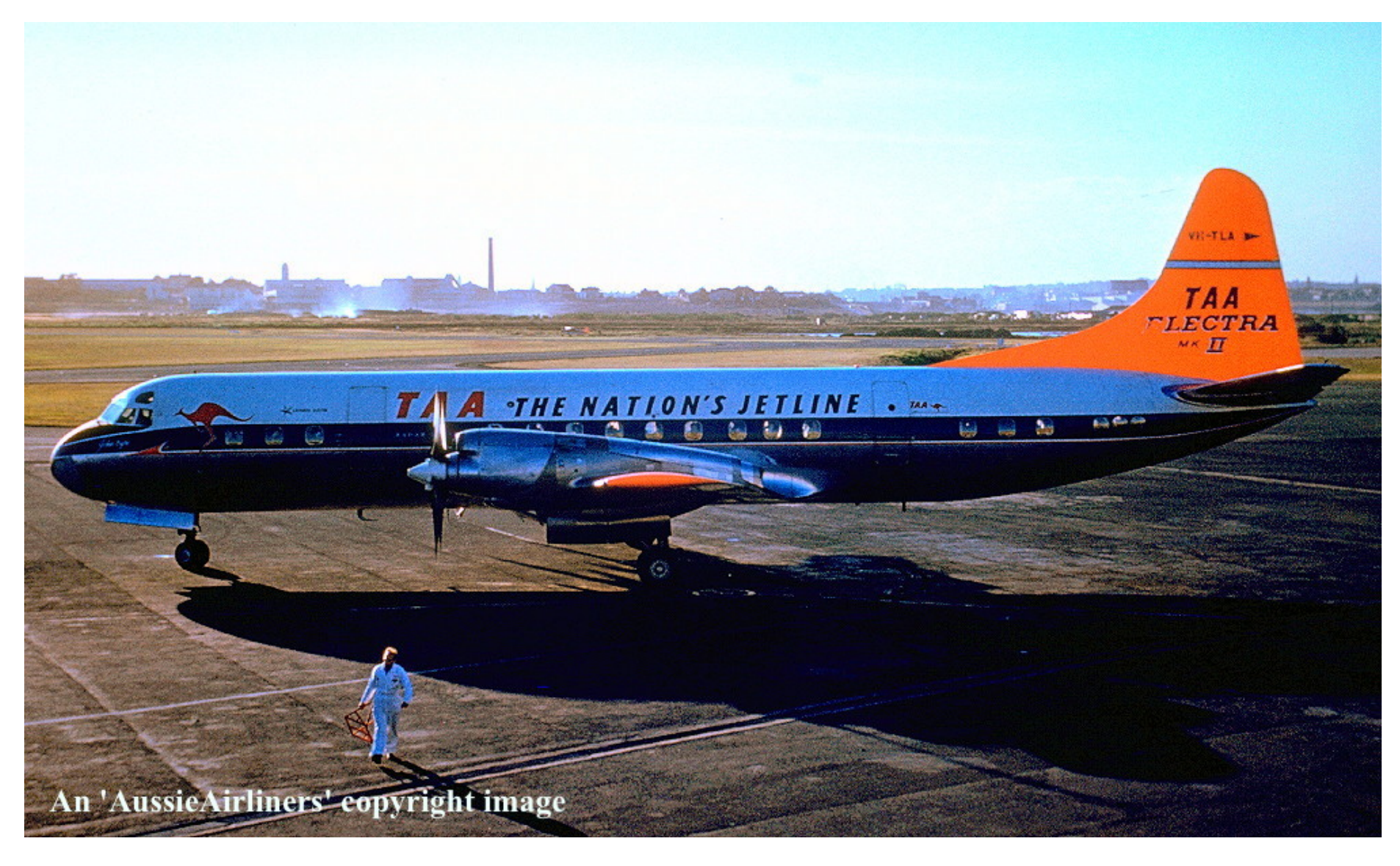
VH-TLA. 'John Eyre' - Sydney Kingsford Smith Airport - June 1962.