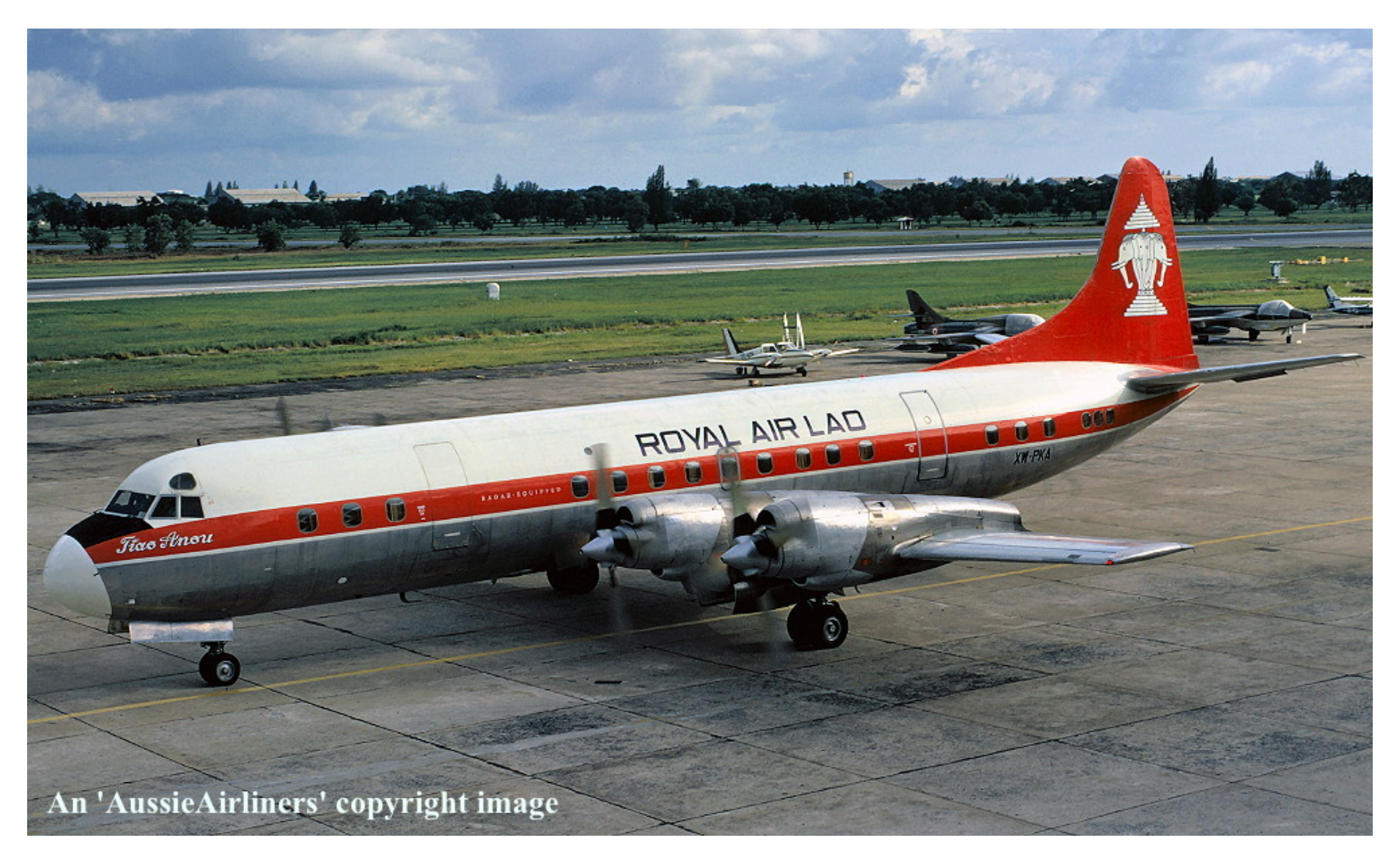
XW-PKA. Royal Air Lao - 'Tiao Anou' - Singapore Seletar Airport - November 1972.