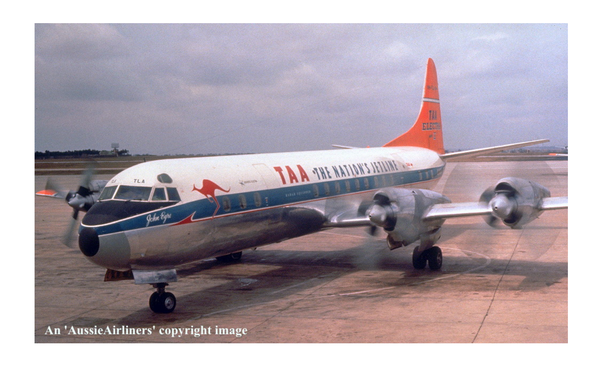
VH-TLA. 'John Eyre' - Brisbane Archerfield Airport - July 1962.