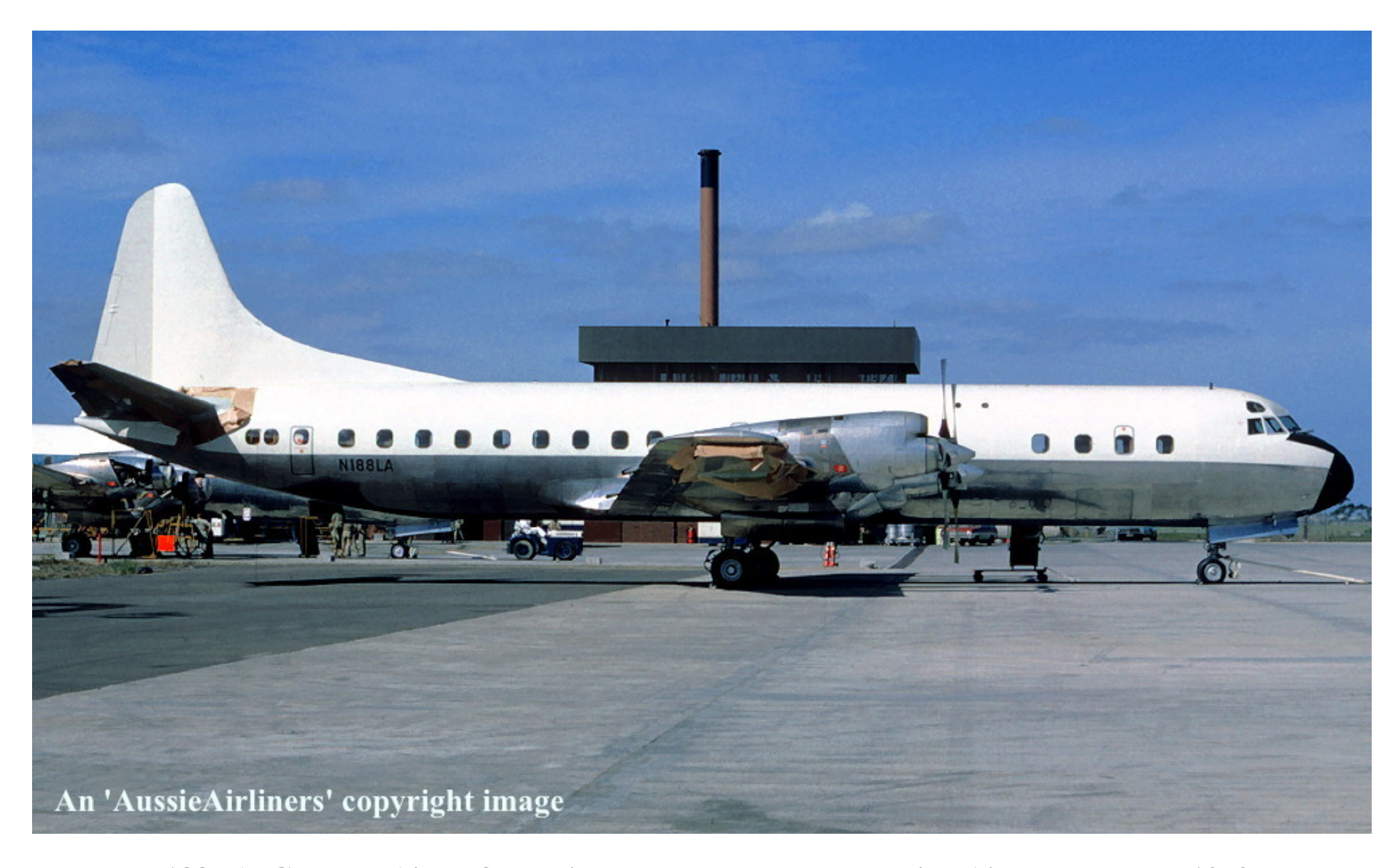
N188LA. Concare Aircraft Leasing - Melbourne Tullamarine Airport - March 1972.