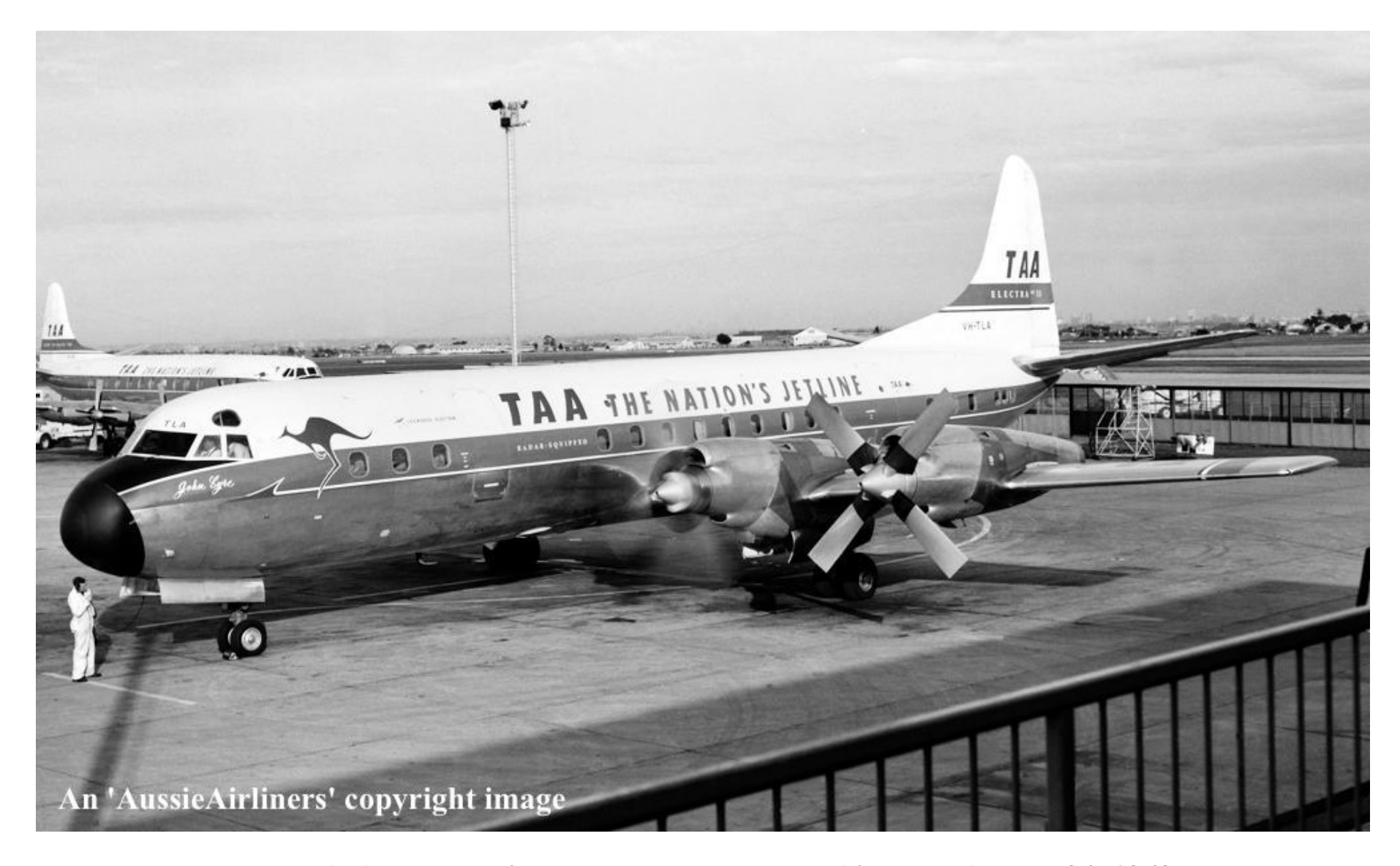
VH-TLA. 'John Eyre' - Melbourne Essendon Airport - August 24, 1963.