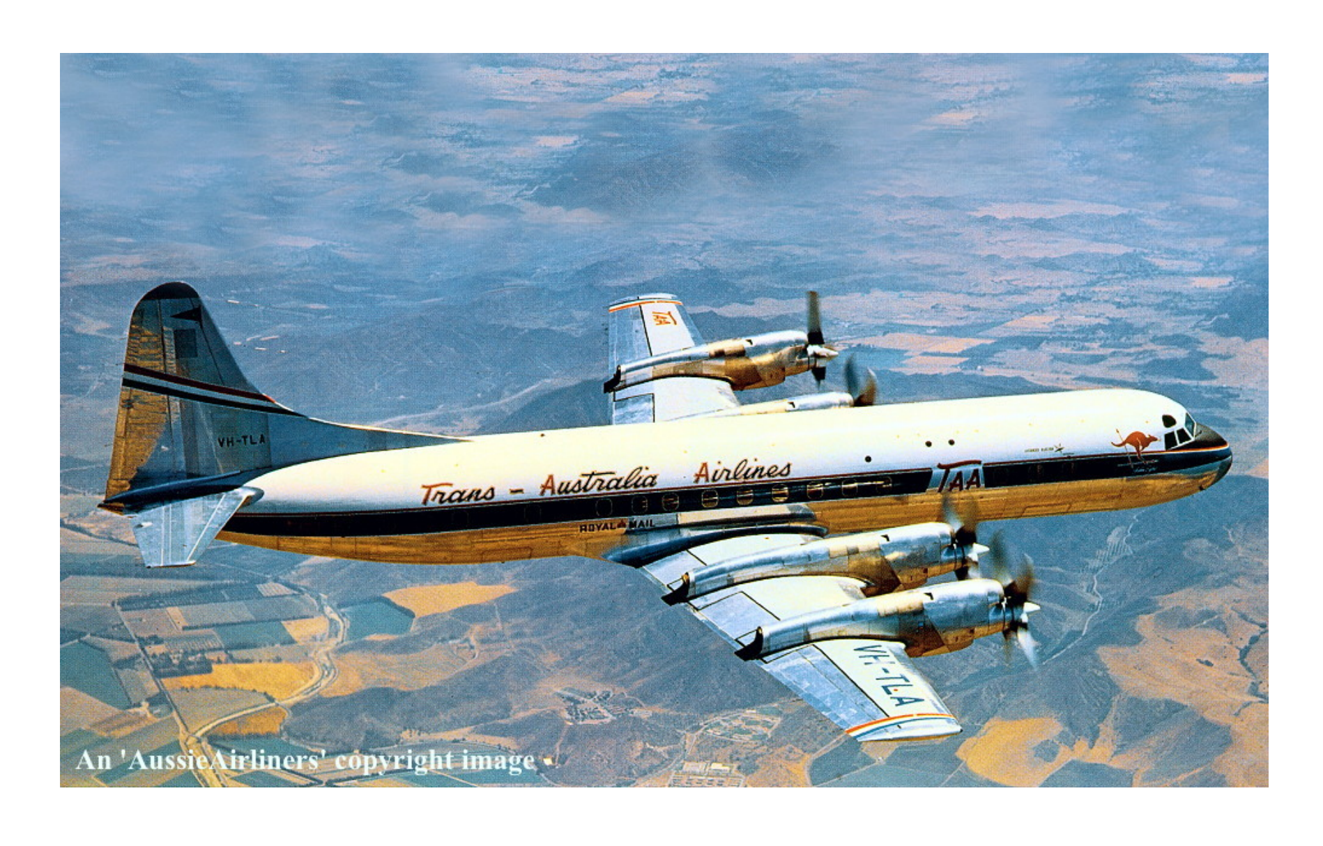
VH-TLA. 'John Eyre' - somewhere over California - June 1959.