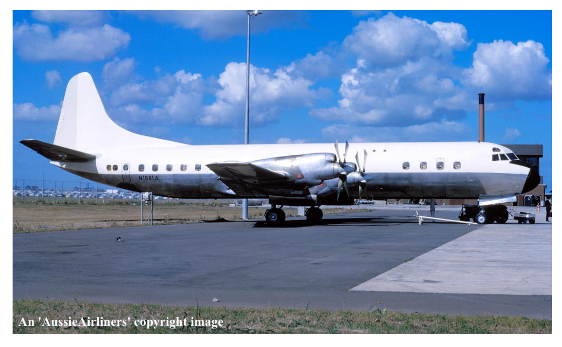
N188LA. Concare Aircraft Leasing - Melbourne Tullamarine Airport - April 1972.