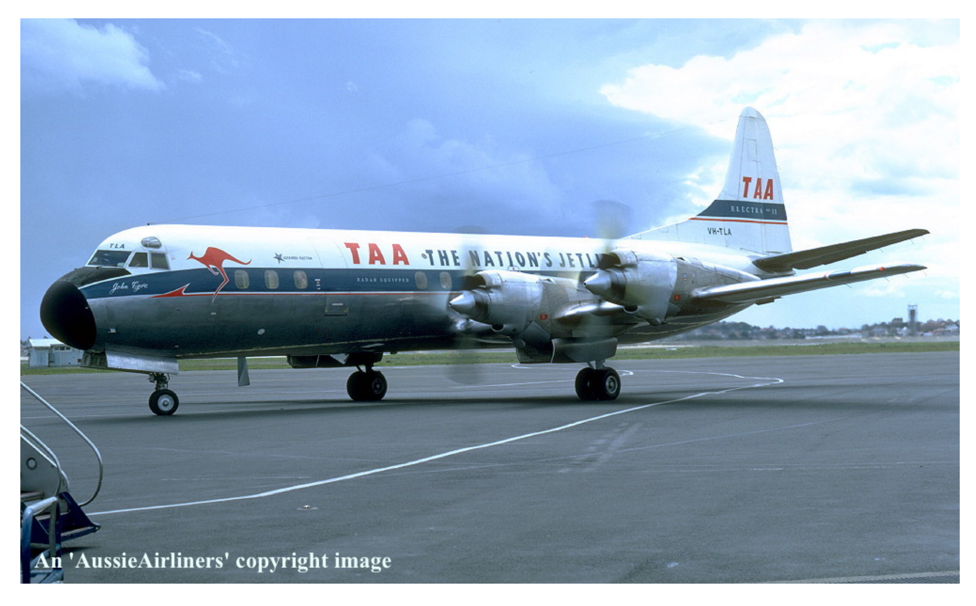
VH-TLA. 'John Eyre' - Sydney Kingsford Smith Airport - December 29, 1966.