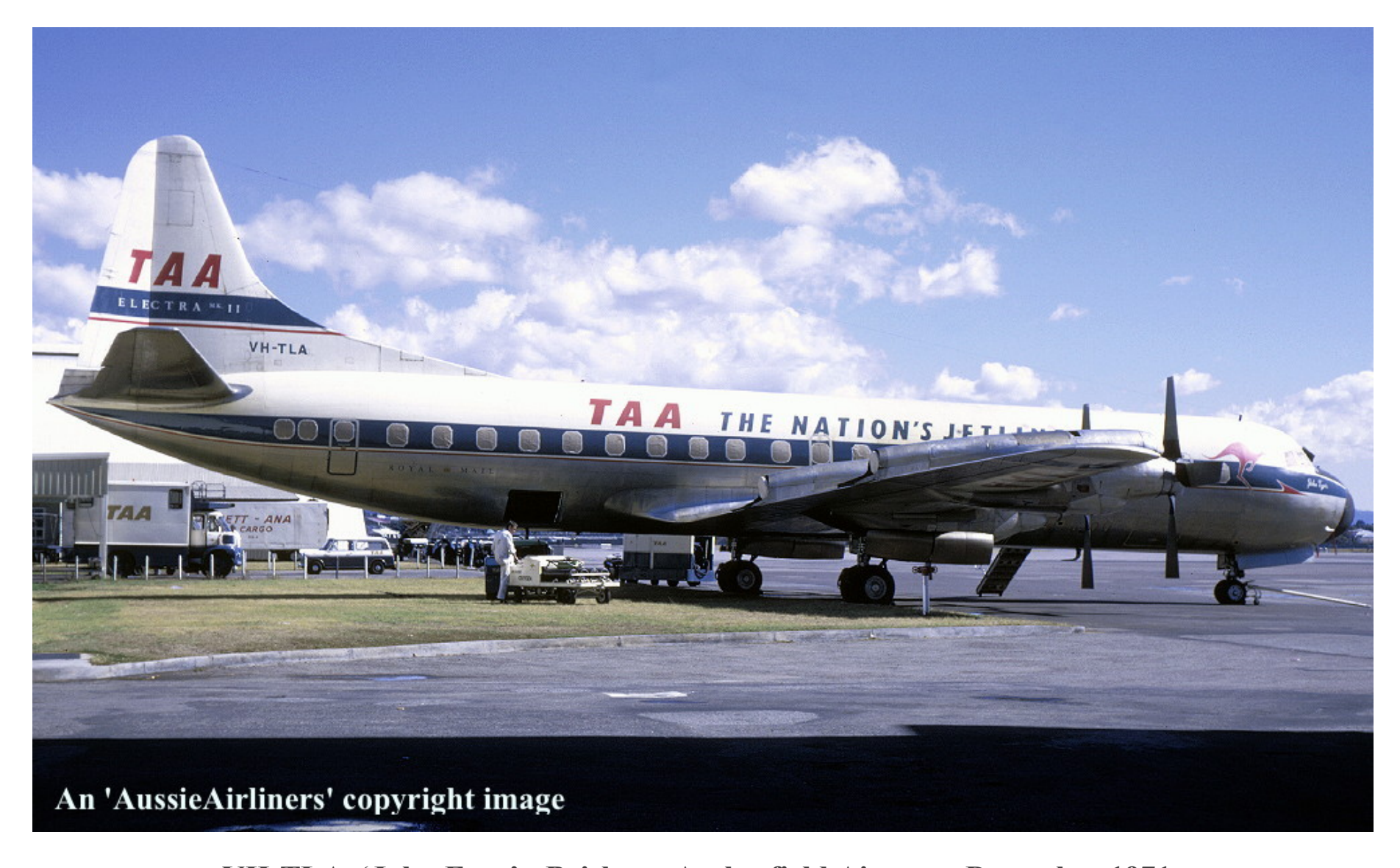
VH-TLA. 'John Eyre' - Brisbane Archerfield Airport - December 1971.