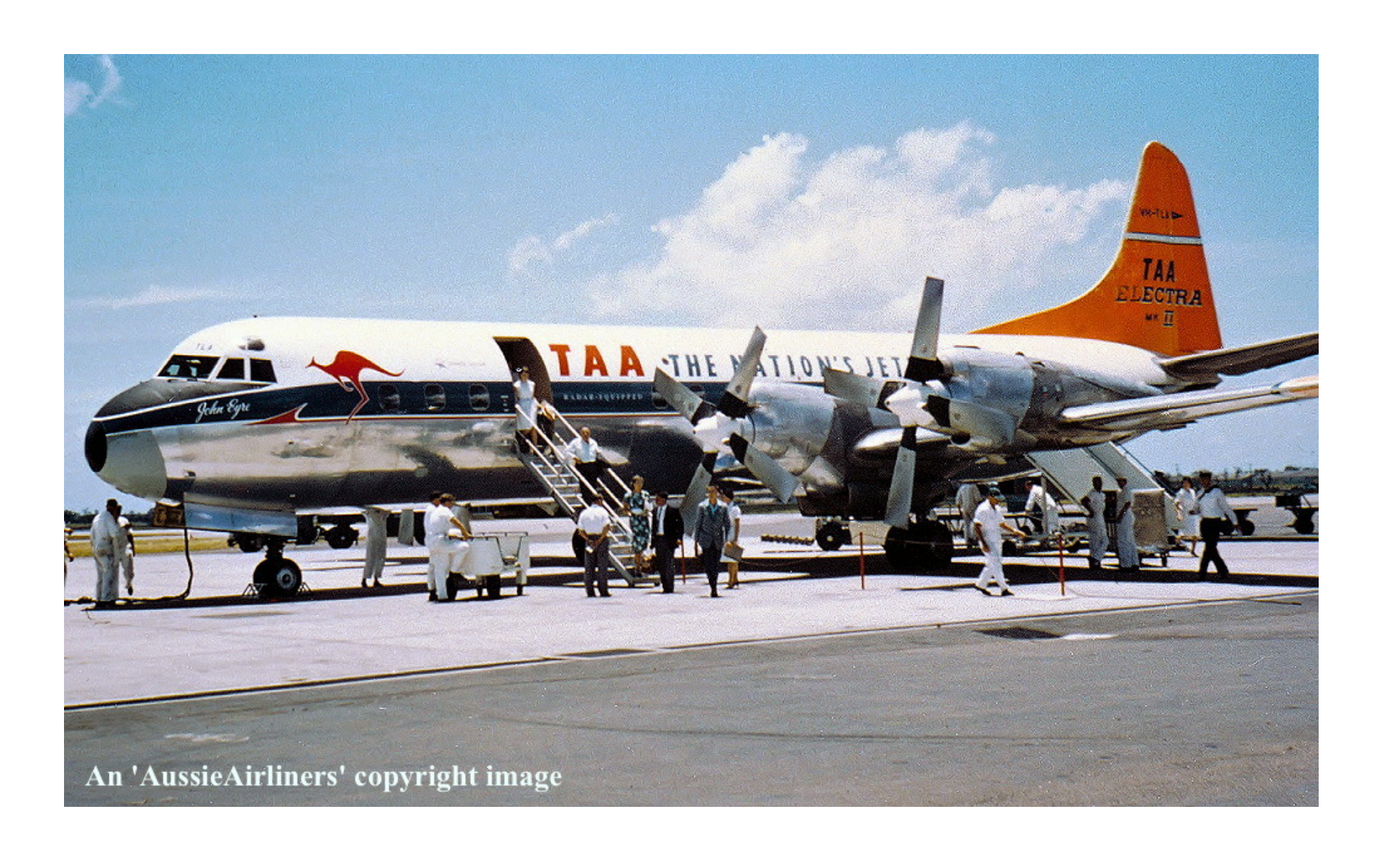
VH-TLA. 'John Eyre' - Brisbane Archerfield Airport - circa 1961.