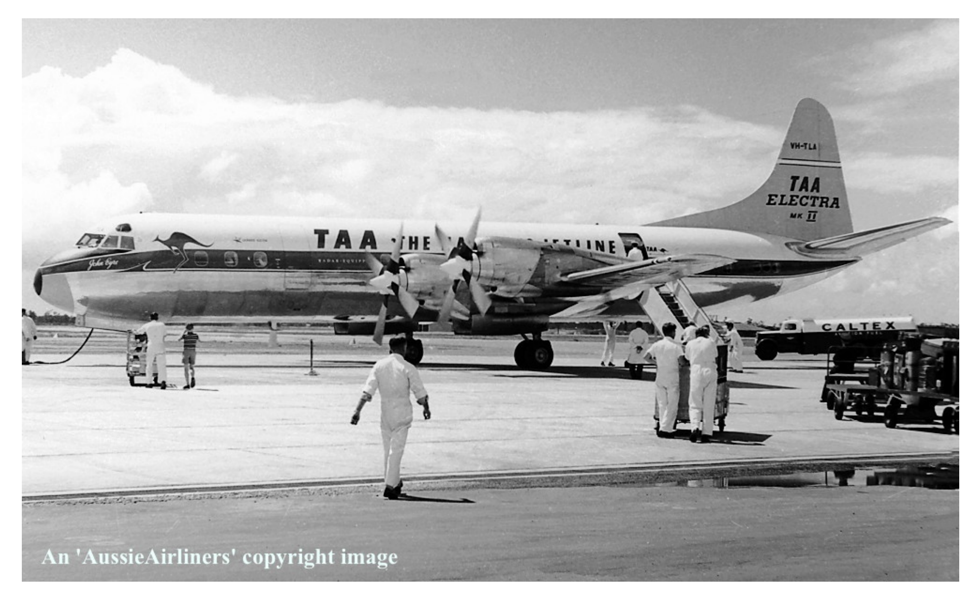
VH-TLA. 'John Eyre' - Brisbane Archerfield Airport - circa 1962.