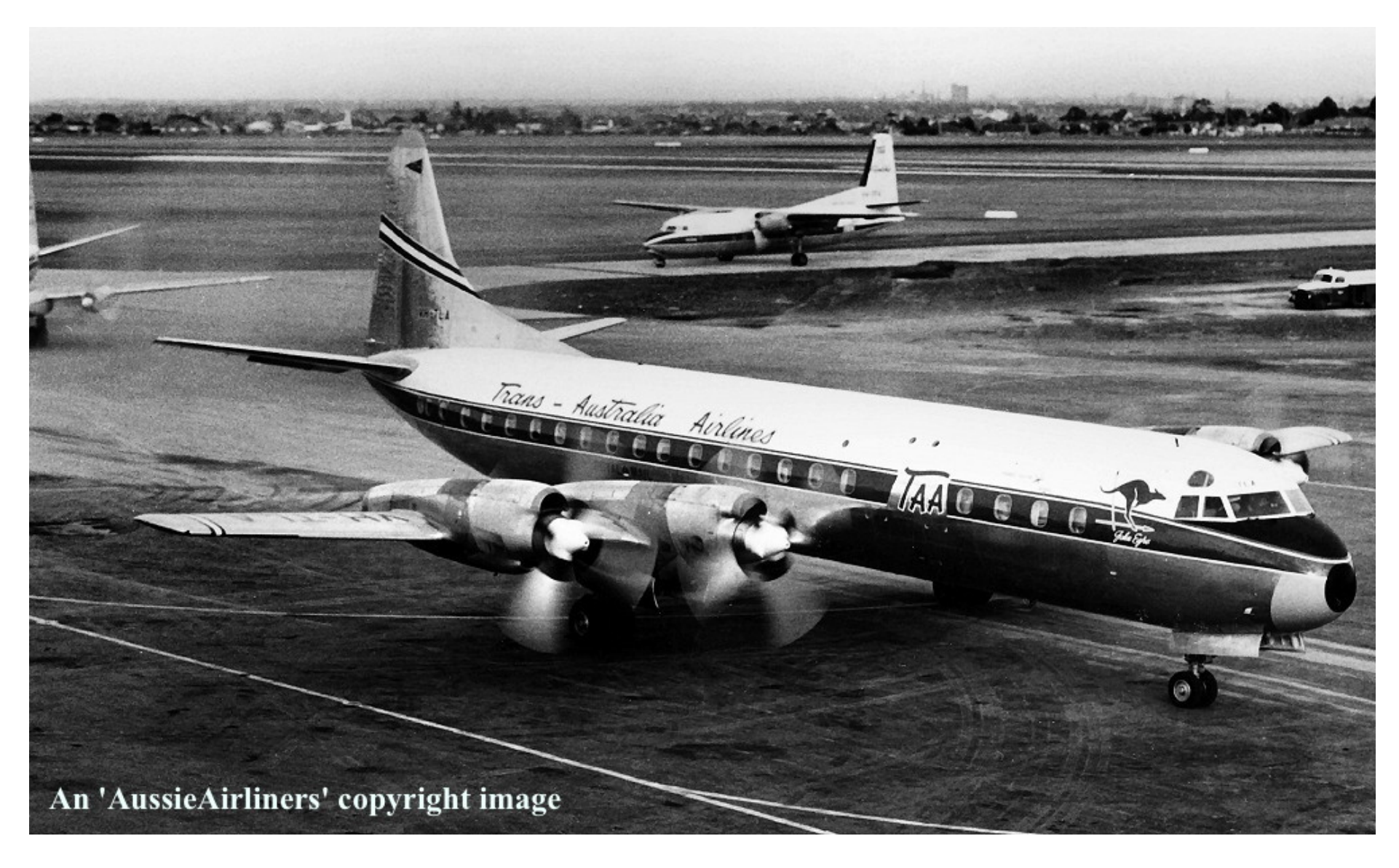
VH-TLA. 'John Eyre' - Melbourne Essendon Airport - June 24, 1959.