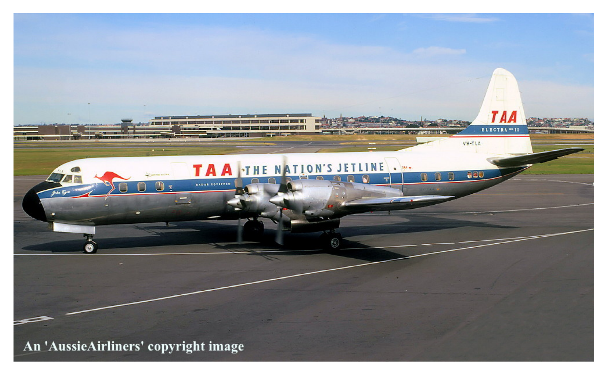
VH-TLA. 'John Eyre' - Sydney Kingsford Smith Airport - April 14, 1970.