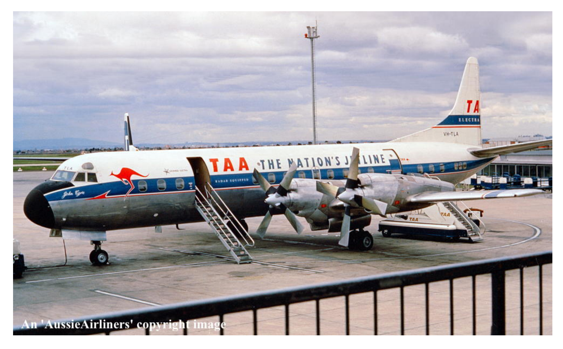
VH-TLA. 'John Eyre' - Melbourne Essendon Airport - date unknown.