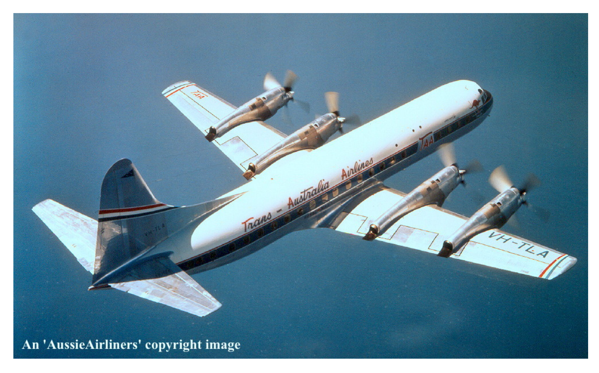
VH-TLA. 'John Eyre' - somewhere over California - June 1959.