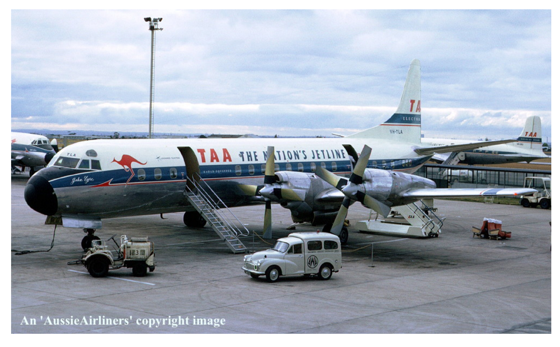
VH-TLA. 'John Eyre' - Melbourne Essendon Airport - July 1966.